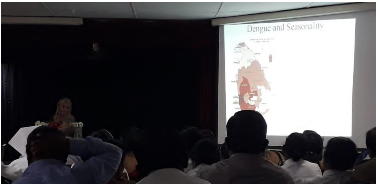
Figure 2: Presenting 'Climate sensitivity of Dengue in Central Sri Lanka' by Rushdha Salih