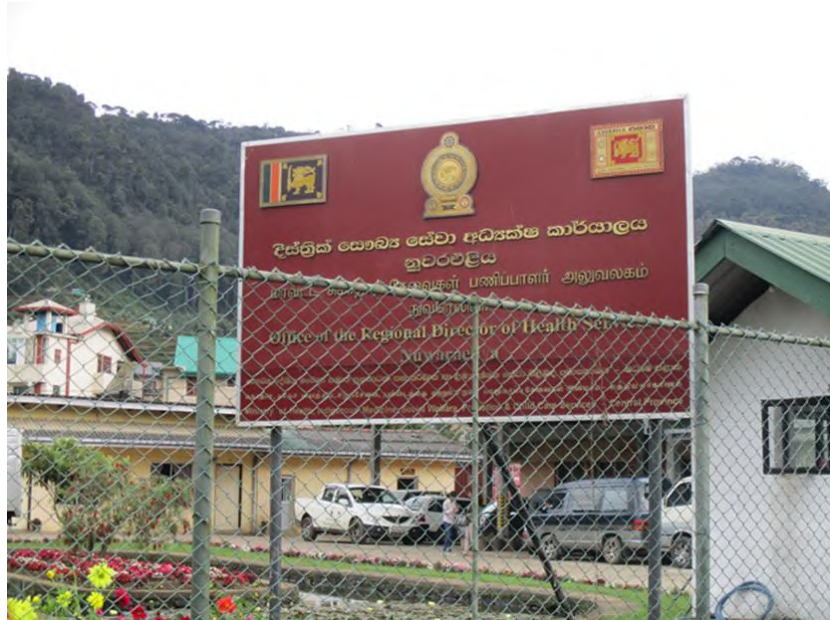
Figure 1: Office of the RDHS Nuwara-Eliya