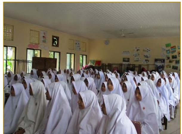
Figure 2: Part of the students of the Muslim Balika Vidyalaya at the event