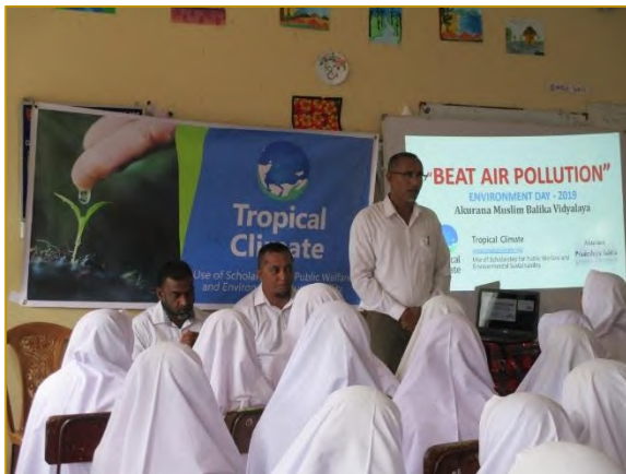
Figure 3: Teacher of the Muslim Balika Vidyalaya welcoming the invitees