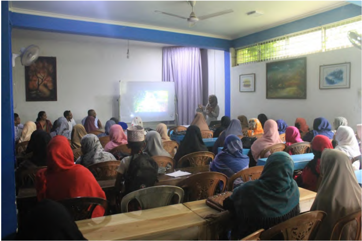
Figure 2: TC Staff presenting on Dengue Control at the event