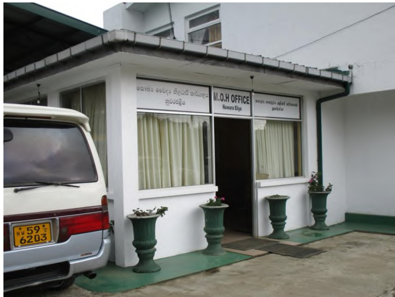
Figure 2: MOH Office Nuwara-Eliya