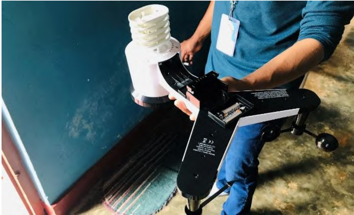
Figure 1: Assembled AWS with alkaline batteries in place