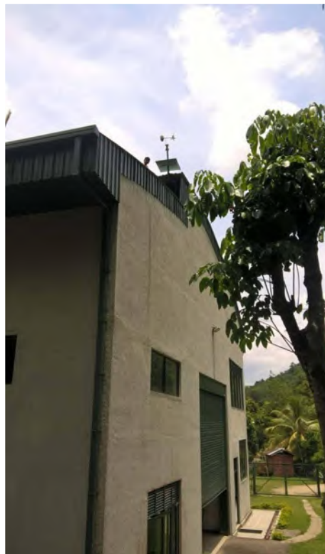
Figure 3: Mounted Ambient weather station W2905