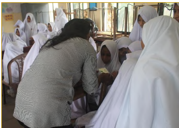
Figure 5: Students getting engaged in observing the air monitoring instrument