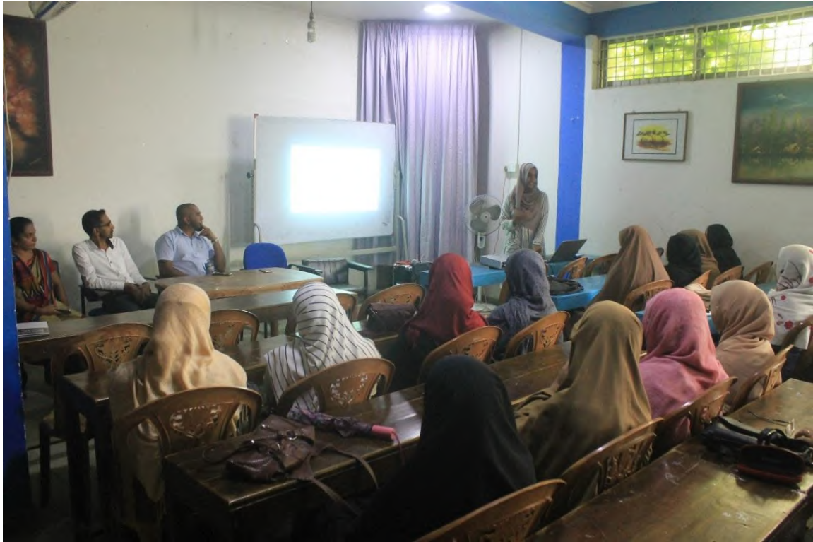
Figure 3: TC staff presenting at the event