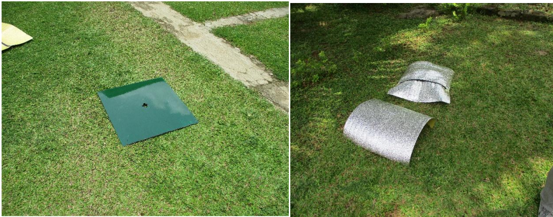
Figure 1: PVC ceiling sheet and insulation shield that was used to control the heat in the roof