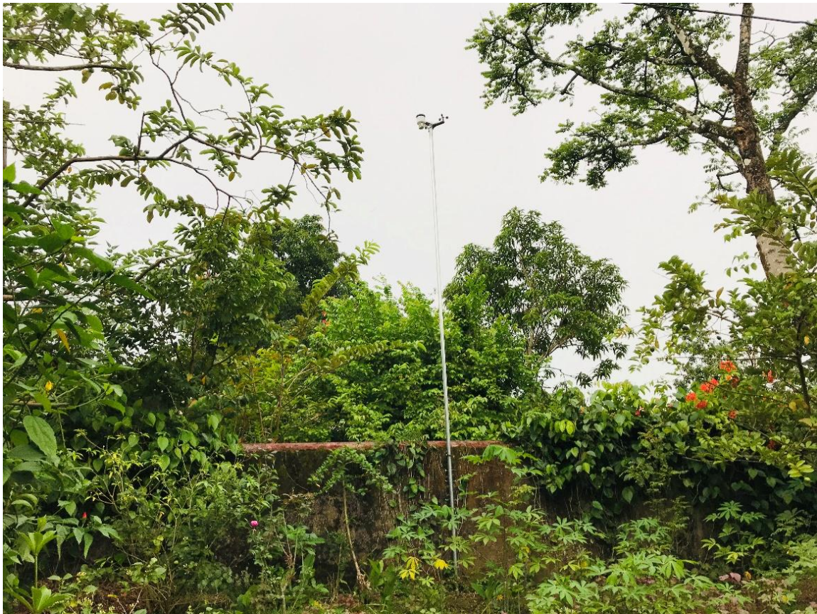
Figure 2: Mounted AWS