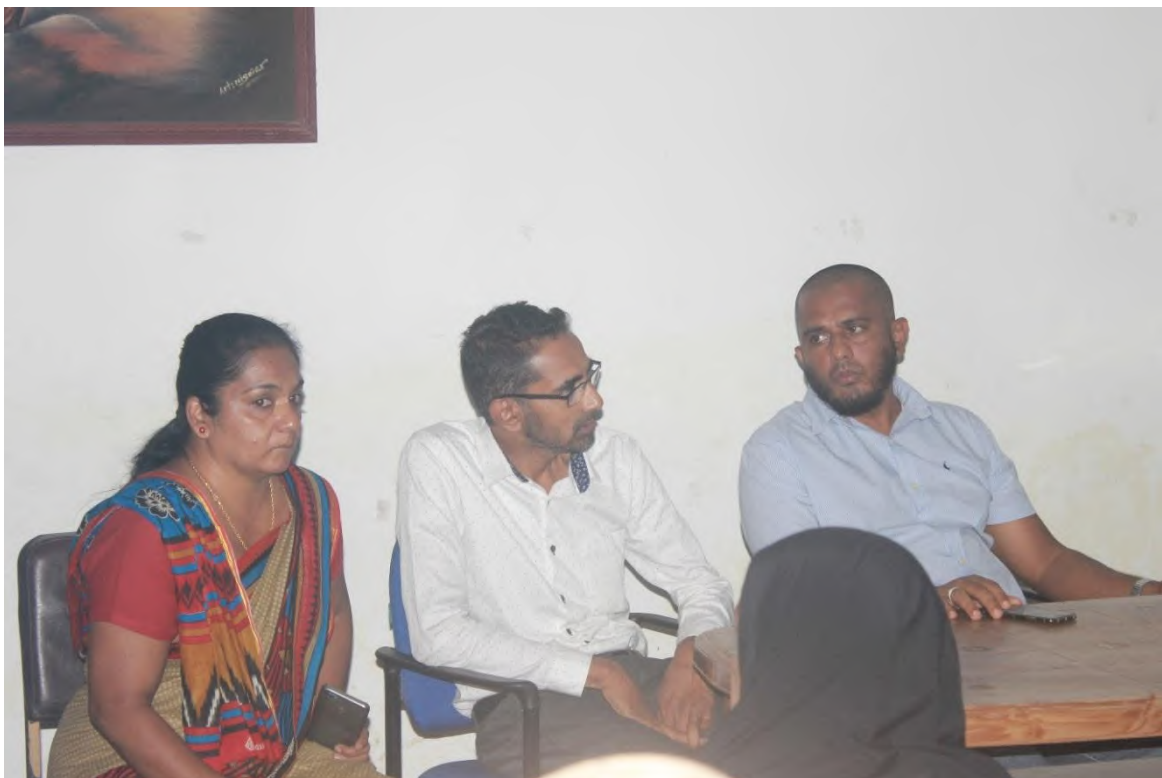
Figure 3: The Environmental officer and the members of the Pradeshiya Sabhawa at the event