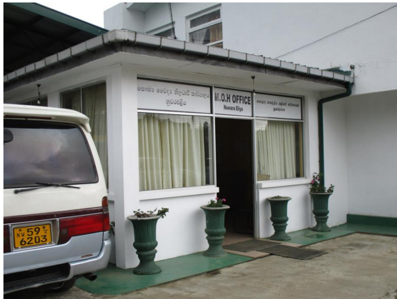
Photo.2 - MOH Office Nuwara-Eliya