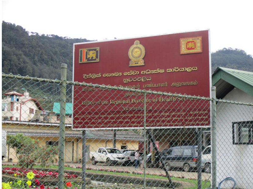
Photo.1 - Office of the RDHS Nuwara-Eliya